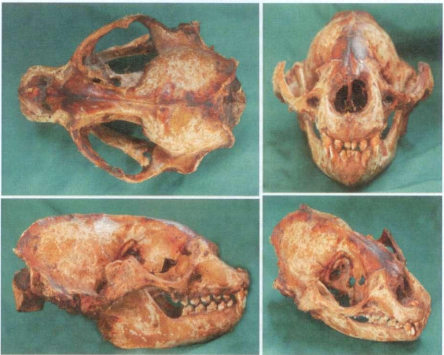
Fig 1. Skull of the adult Mediterranean monk seal ( Monachus monachus ) from Biševo, Adriatic Sea, 1964.

were removed from the skull and it was dried, not cooked. This skull has hardly visible skull bone sutures and was defined as adult (Fig.1.). The adult skull was found in Komiža, island Vis, middle Adriatic Sea. The exact cause of death is not known, but it originates from the year 1964 and it is presumed that the specimen was killed by a fisherman on the small island Biševo, close to the island Vis. Twenty-four cranial measurements were taken using digital calipers and read to the one tenth of millimeter. (Fig. 2.). DNA was isolated from dry tissue of dental alveoli in order to determinate the sex of the specimen. Polymerase chain reaction (PCR) was performed using four primers (GILSON et al., 1998).